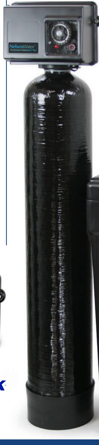
Pentair Fleck 2510 Time Clock Control Valve Shown on Softener

The economic 2510 Time Clock Control is as simple to set as turning a dial.