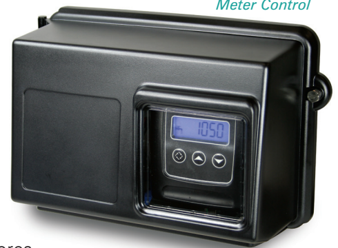
2510 SXT Electronic Meter Control

The 2510 SXT Electronic Meter Control provides your home with conditioned water based on your family's water usage, regenerating only when needed. This environment-friendly control ensures you years of soft water; saving you money, water and regenerant.