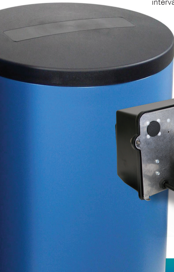
2510 Time Clock Control Shown on Softener

Six Independently Adjustable Cycle Times. Guest regeneration button to easily initiate a manual regeneration. Calendar override automatically regenerates the system at a time interval you select if usage hasn't initiated a regeneration.