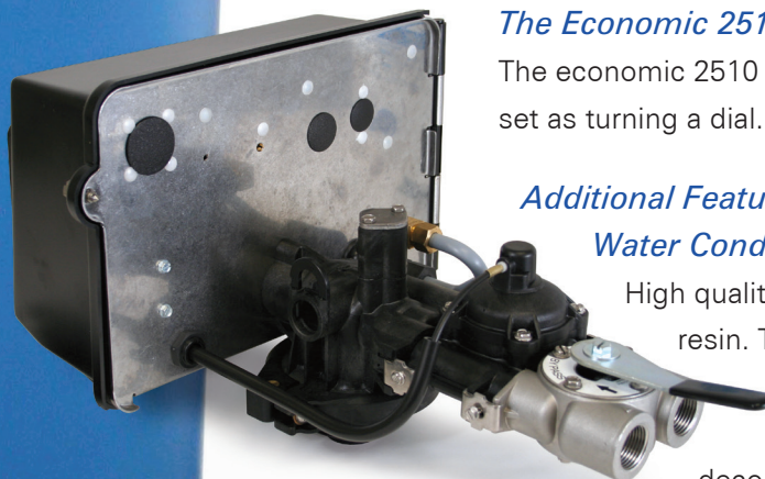
2510 Mechanical Meter Control Shown with Optional Bypass

High quality, cation water softener exchange resin. Tough, high density, polyethylene salt storage tank. Additional features available to match any decor. Electricity cost per month is approximately .29 cents*.